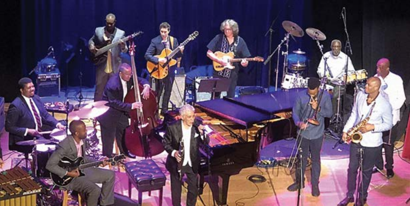
The 10th Annual Monty Alexander Jazz Festival, Labor Day Weekend 2019